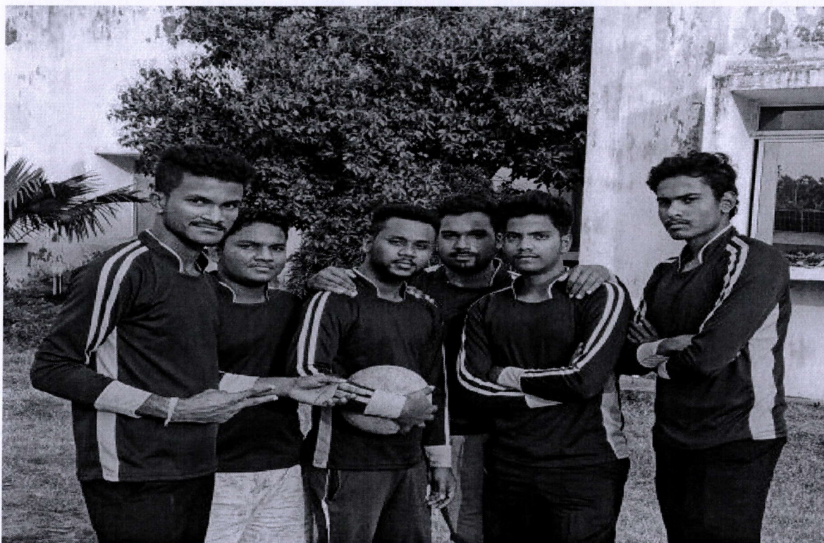
Fig. 8 Volley Ball Team