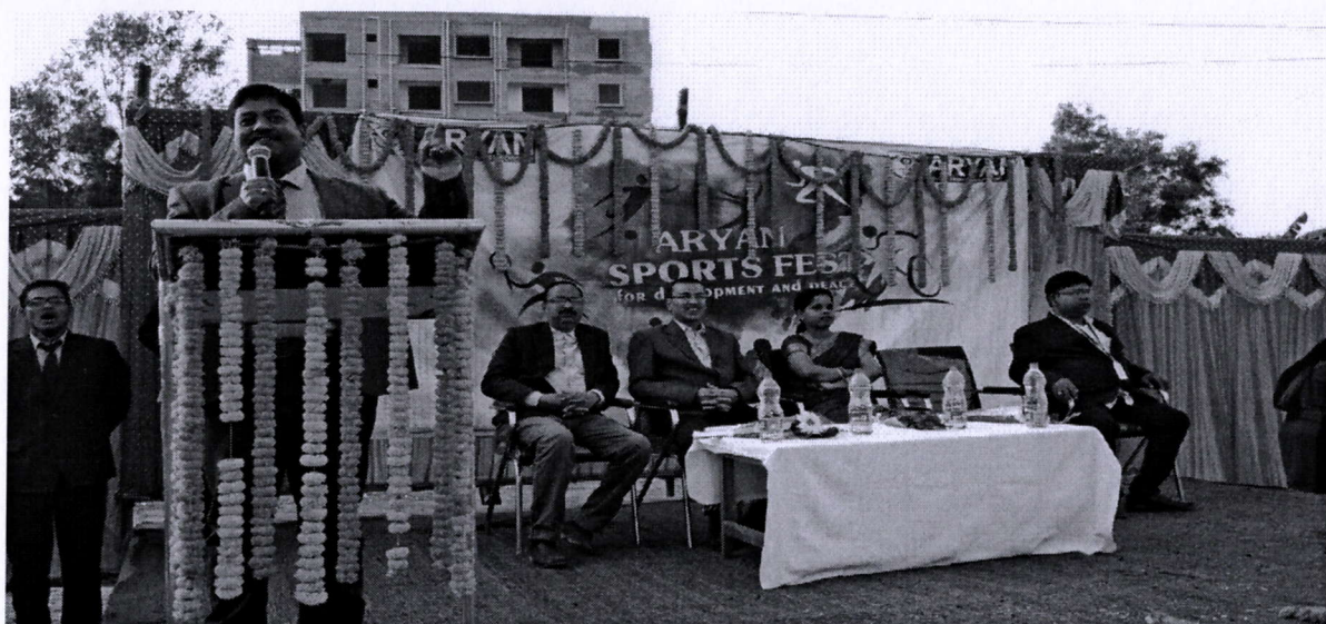
Fig. 12 Annual Sports Meet