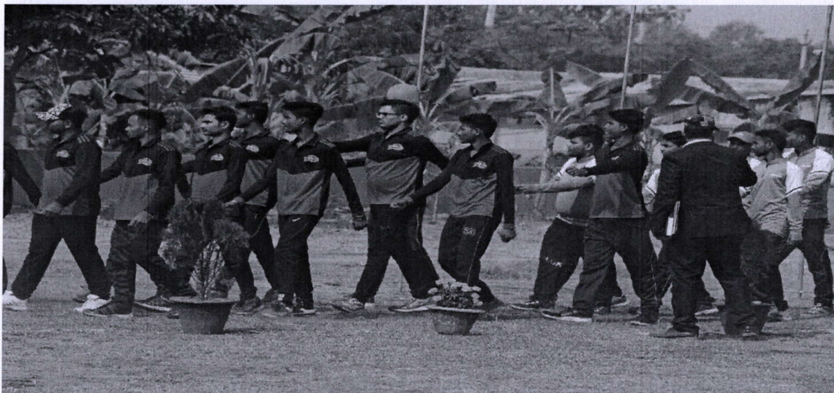
Fig. 5 Cultural Fest-17