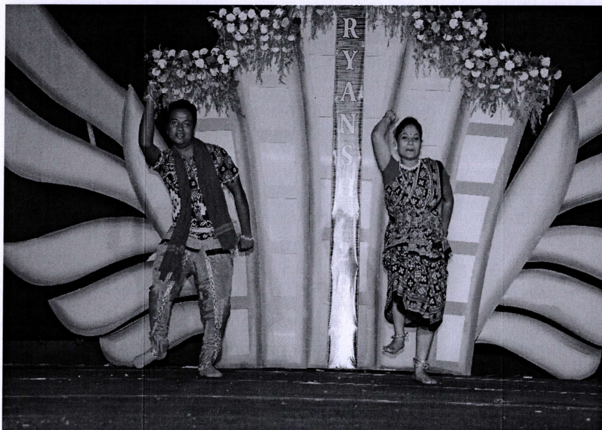
Fig. 1 Dance (Cultural Fest-17)