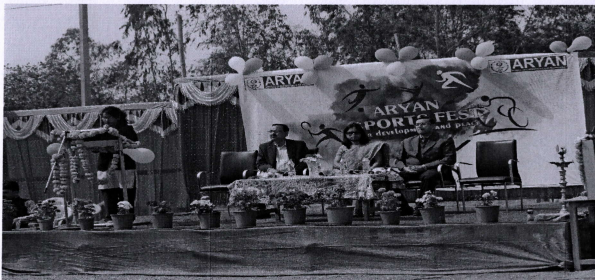
Fig. 2 Solo Song (Cultural Fest-17)