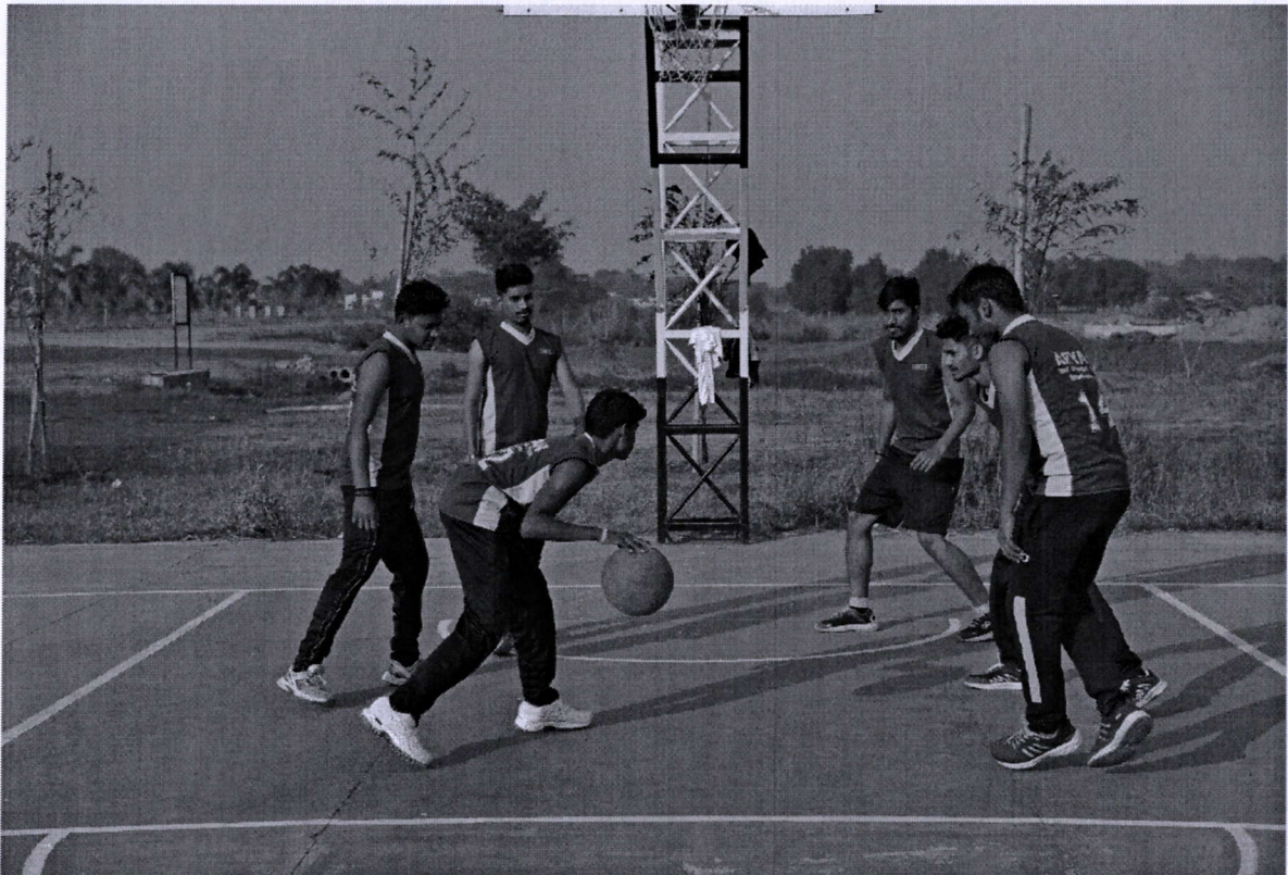
Fig. 6 Basket Ball Tournament