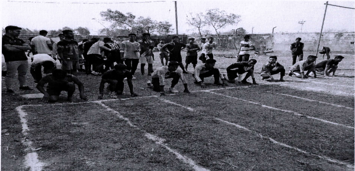
Fig. 4 100 mtr. Race (Athletic Meet-2017)