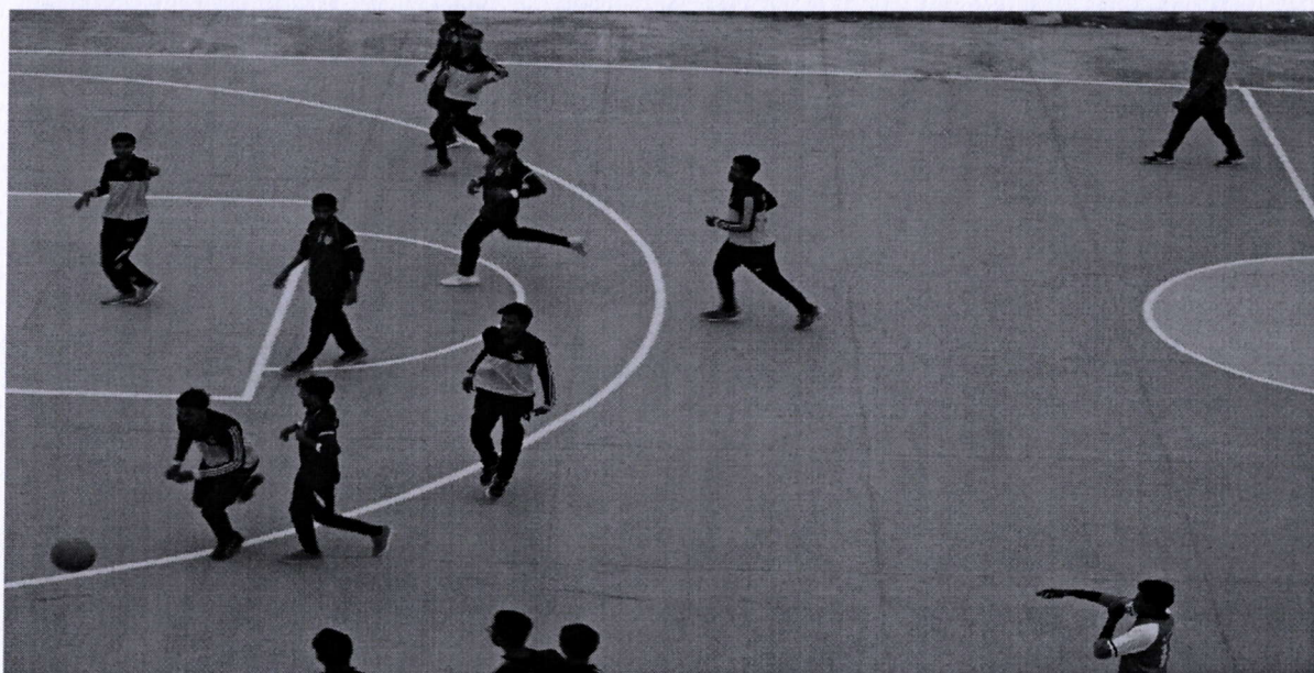
Fig. 10 Basket Baal Match