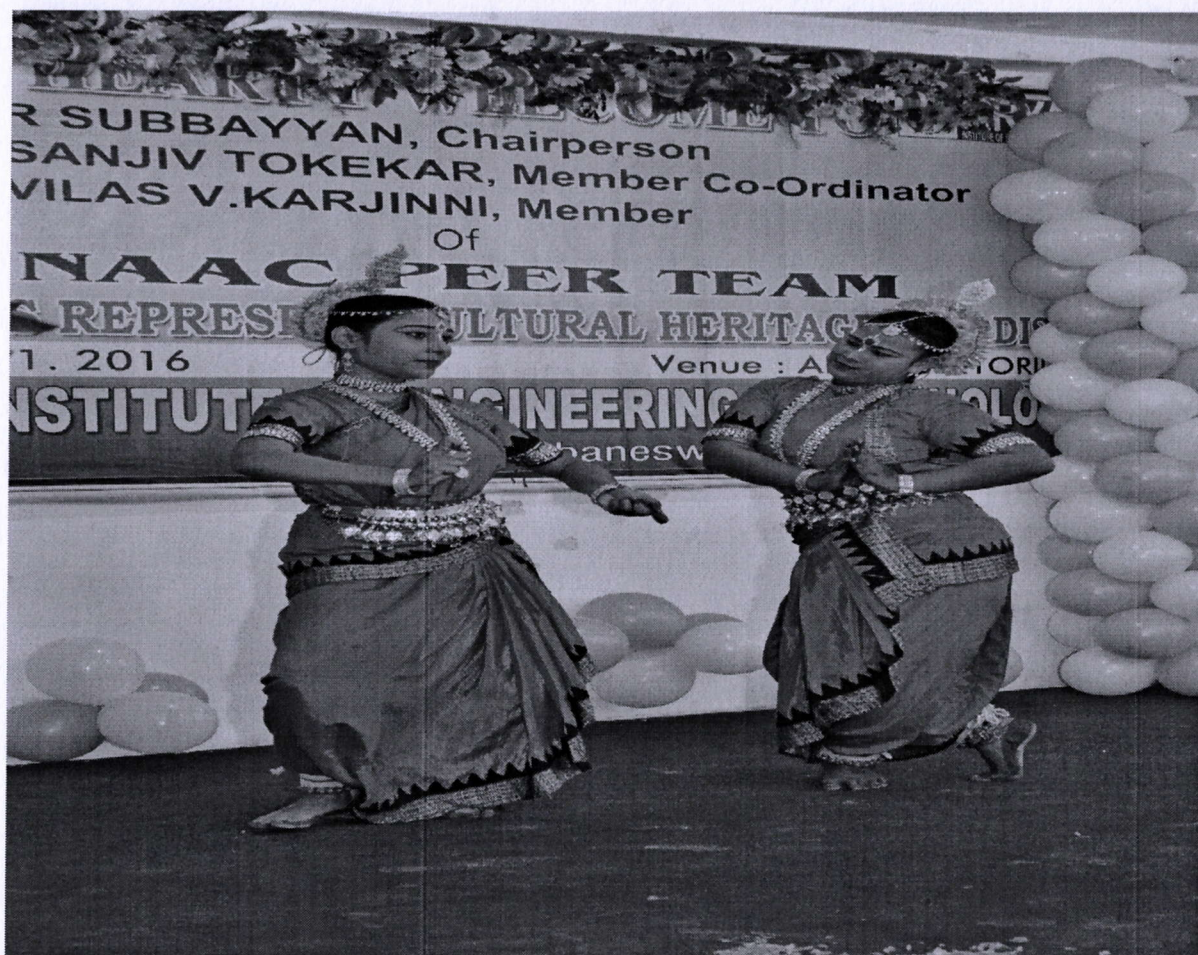
Fig. 3 Odishi (NAAC PEER TEAM)