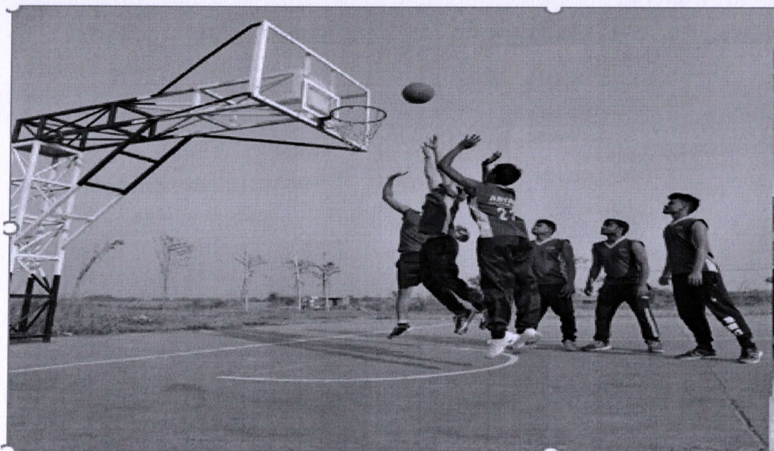
Fig. 13 Basket Baal Tournament