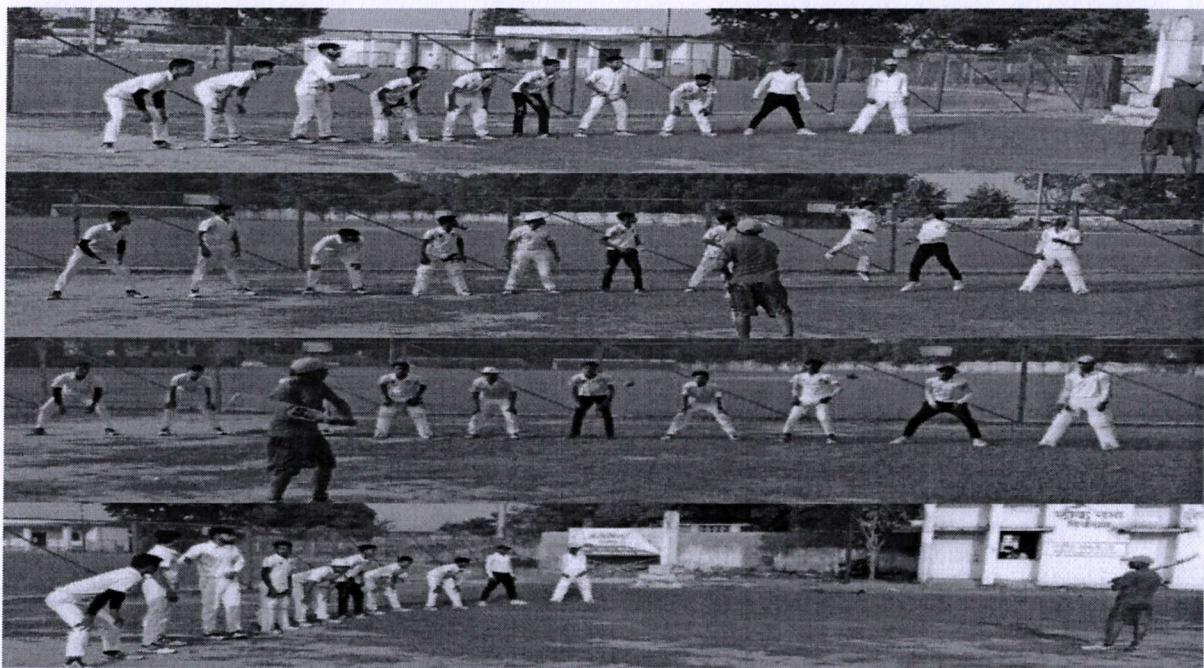
Fig. 12 Cricket Tournament