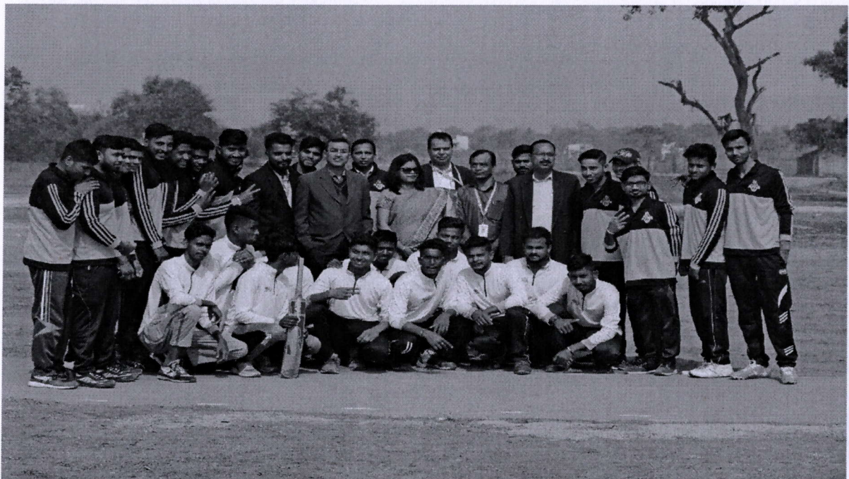
Fig. 9 Aryan Cricket Team